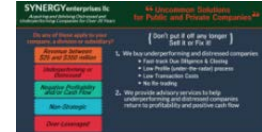
Orphans & Carve-outs