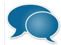
Webinar Sample Q&A