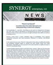
Article "Point A to Point B"