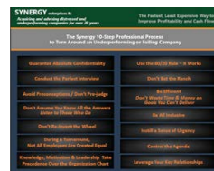
Critical Turnaround Rules