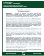
Acquisition vs. Advisory